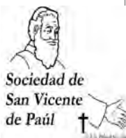
Sociedad de San Vicente de Paúl

No te rompas la espinilla con un banco que no esté en tu camino. —Proverbio irlandés