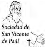
Sociedad de San Vicente de Paul

La despensa de San Vicente de Paul esta necesitando pollo enlatado, fruta enlatada, Hamburger/Tuna/Chicken Helper, comidas enlatadas, acompañamientos en caja, harina par panques y miel, . Gracias por ayudar a los mas necesitados de nuestra parroquia.