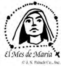
El Mes de Maria

La despensa de San Vicente de Paul esta necesitando pollo enlatado, fruta enlatada, Hamburger/Tuna/Chicken Helper, comidas enlatadas, acompañamientos en caja, harina par panques y miel, . Gracias por ayudar a los mas necesitados de nuestra parroquia.