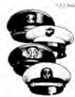
Día de los Caídos