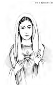
Immaculate Heart of Mary