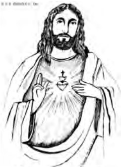
Most Sacred Heart of Jesus

So that we all can visit our new grotto during the week we will have one of the front gates open daily from 8 am to 5 pm Monday thru Saturday.