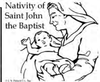
Nativity of Saint John the Baptist