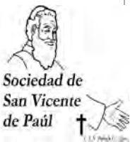
Sociedad de San Vicente de Paul

La naturaleza tiene perfecciones a fin de mostrarnos que ella es la imagen de Dios, así como defectos para mostrarnos que es apenas imagen de Dios. —Blas Pascal