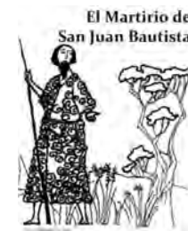
El Martirio de San Juan Bautista