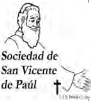
Sociedad de San Vicente de Paúl

La despensa de San Vicente de Paul esta necesitando pollo enlatado, fruta enlatada, Hamburger/Tuna/Chicken Helper, comidas enlatadas, acompañamientos en caja, harina par panques y miel, . Gracias por ayudar a los mas necesitados de nuestra parroquia.