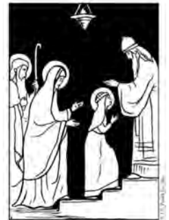
Presentation of the Blessed Virgin Mary