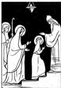
Presentación de la Santísima Virgen María