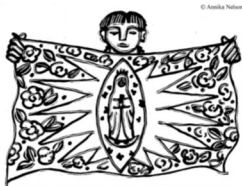
ST. JUAN DIEGO