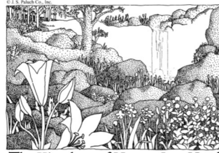
The Kingdom of Heaven Is at Hand.