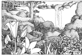
EL REINO DE LOS CIELOS ESTÁ CERCA